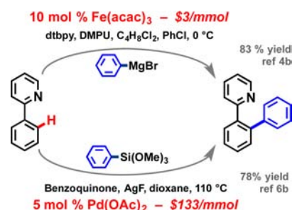
Scheme 1. Comparison of C–H Arylation Methods

reaction's yield, possibly as a consequence of reduction of the imine; on a few occasions, the corresponding amine was isolated as a minor product.